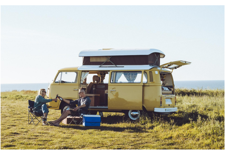
Power your Next Adventure