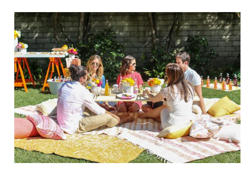
Portable Power Far from Home