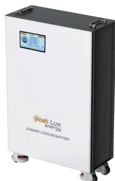
15kWh, 51.2V, 300Ah