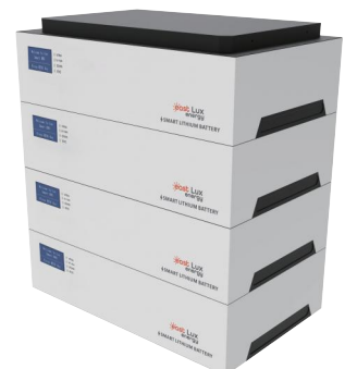
5kWh, 51.2V, 100Ah